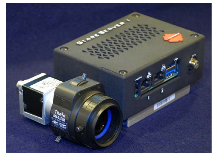
StareServer 1 is a server in a compact box (11 cm in length) with the Basler ace U camera acA4024-29um and a high-resolution lens.