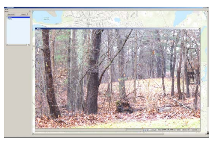
StareViewer 2019 is a Windows application that shows the live video stream from the employed cameras and zooms in on unusual behavior.

The ace U with the STARVIS sensor IMX226 turned out to be the perfect match for this system. The back-illuminated sensor is extremely sensitive in low-light conditions. According to Khan, usually such applications employ infrared cameras which are much more expensive and thus unaffordable for civil applications. Also, the combination of the high resolution of 12.2 MP and small pixel size of 1.85 \mu m allows the camera to stay compact. The camera and the server can fit in a small turret, pantilt-zoom (PTZ) housing or even on a drone.