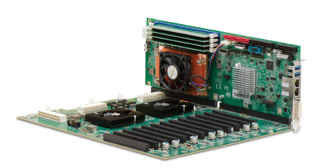
Matrox SHB-Q170 in 13-slot PCIe backplane