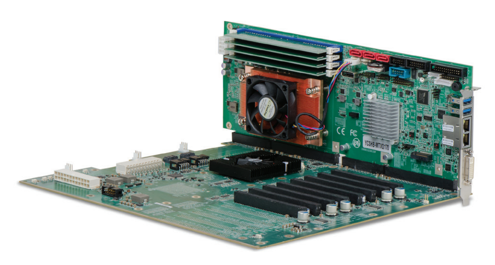
Matrox SHB-Q170 in 8-slot PCIe backplane